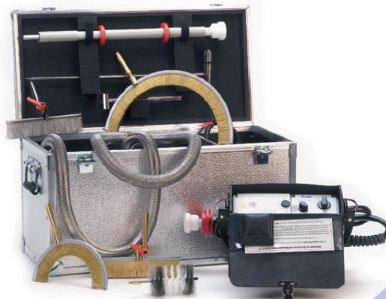
A selection of the wide range of accessories