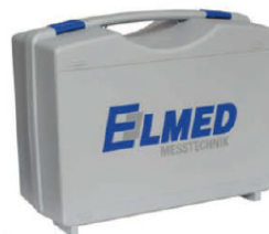
Transport box within the scope of supply

More up to date information at www.isotest.de