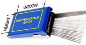
THE STANDARD PLUS COMES WITH OVER 3 SQ. INCHES OF IMPRINTABLE AREA